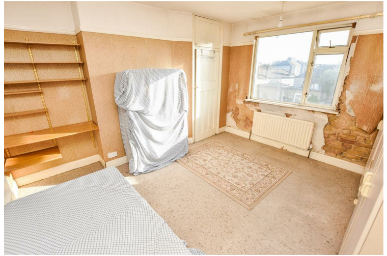
Bedroom Two 13'1 x 11'4 (3.99m x 3.45m)

Upvc double glazed window to rear aspect, carpet, artex ceiling, storage cupboard housing boiler (installed 2021), radiator, TV and power points.