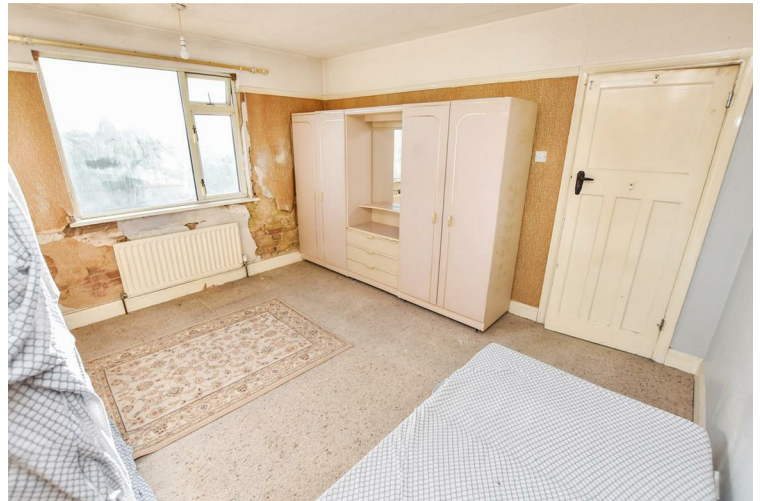
Bedroom Three 9'2 x 6'11 (2.79m x 2.11m)

Upvc double glazed window to front aspect, carpet, picture rail, artex ceiling, radiator, TV and power points.