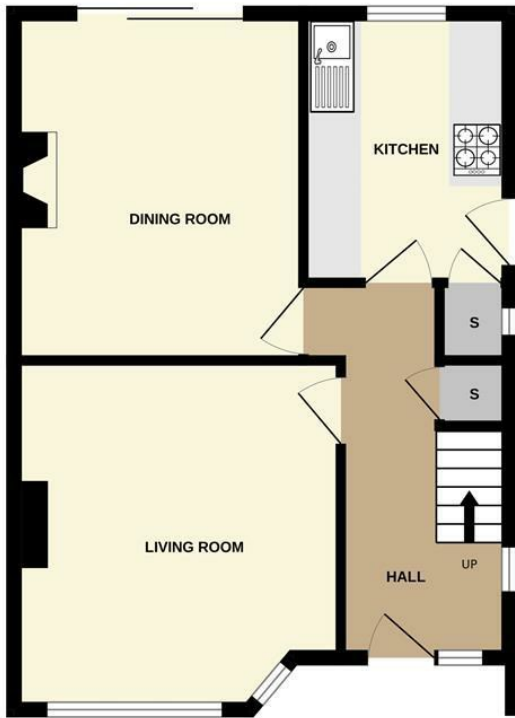
Ground Floor 464 sq.ft. (43.1 sq.m.) approx.