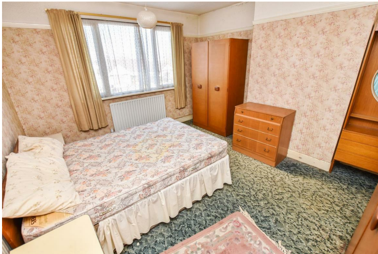
Bedroom One 13'2 x 11'9 (4.01m x 3.58m)

Upvc double glazed window to front aspect, carpet, picture rail, artex ceiling, radiator, TV and power points.